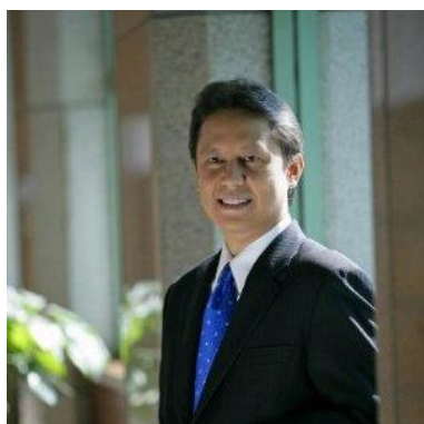
Budi Gunadi Sadikin*